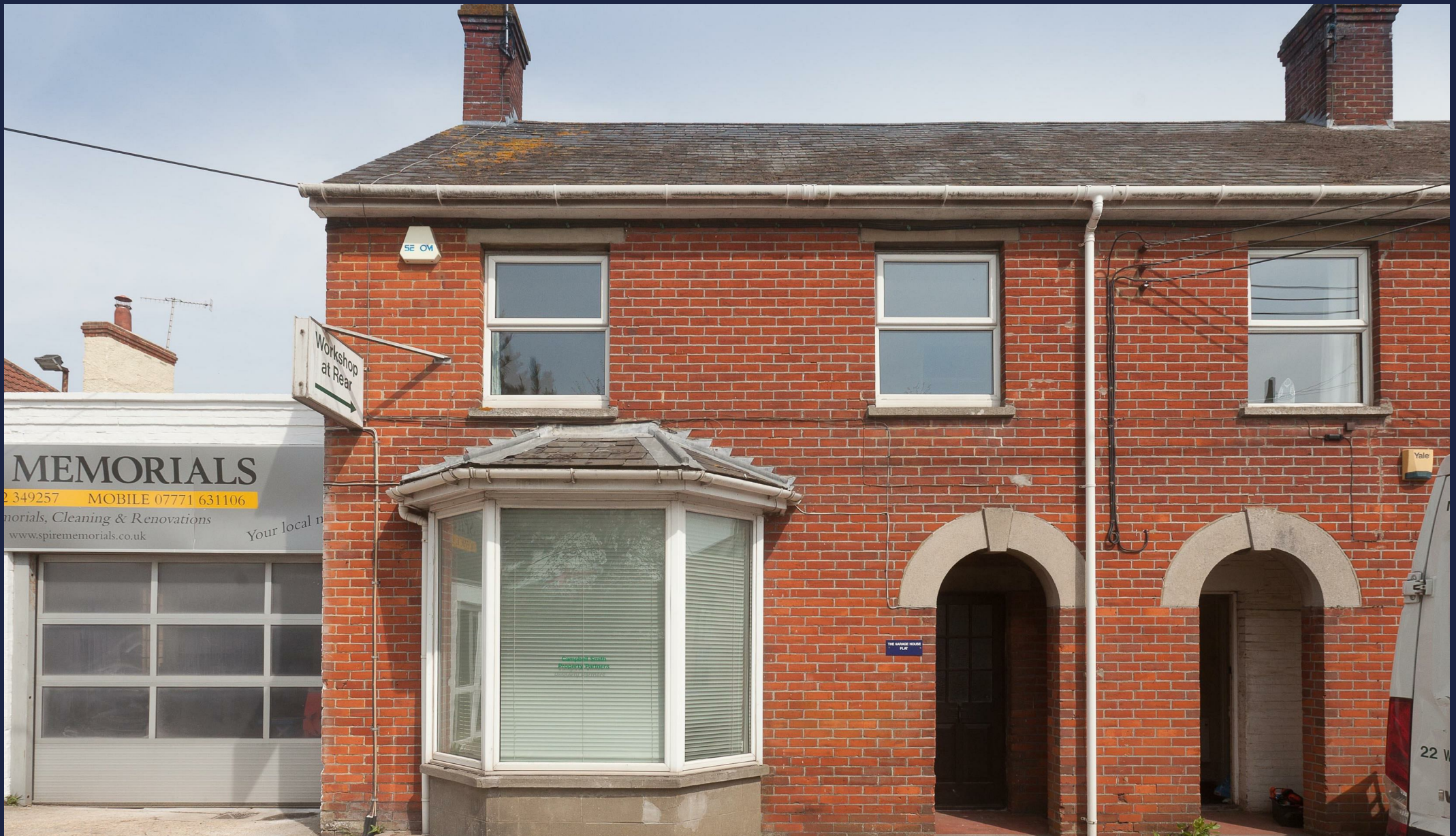
The Garage House Flat, Warminster Road, Salisbury